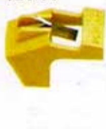
PN-145 Replacement Stylus