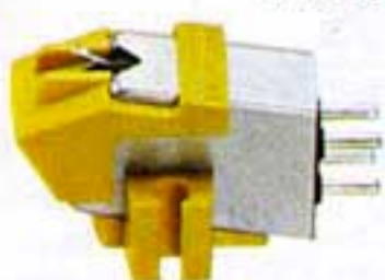
PC-145 Induced Magnet Cartridge