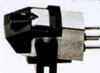
PC-135 Induced Magnet Cartridge