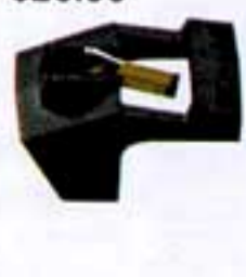
PN-135 Replacement Stylus